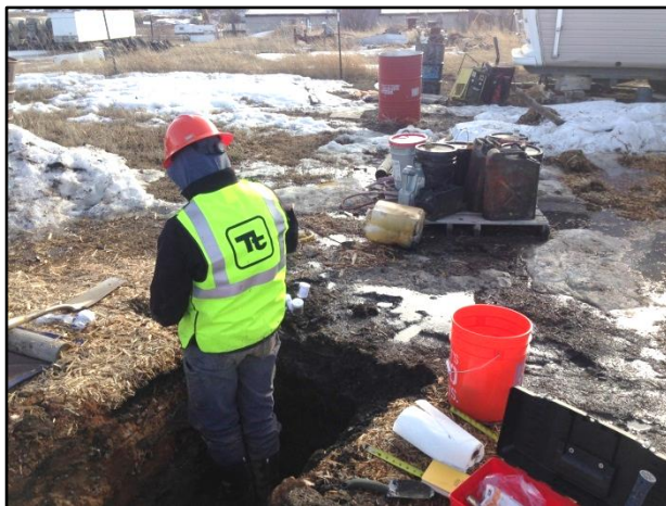
Sampling test pit of former dump and wood treating operation for pentachlorophenol and petroleum, Lewistown. (Feb. 2016)