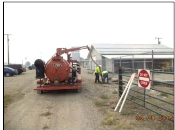
Using vacuum truck to daylight fiber optic line prior to excavation of contaminated soil; Deer Lodge (Sept. 2015)