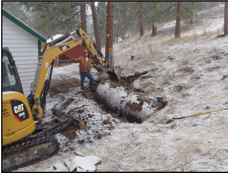
Removing half-buried tank at Unionville School (March 2016)