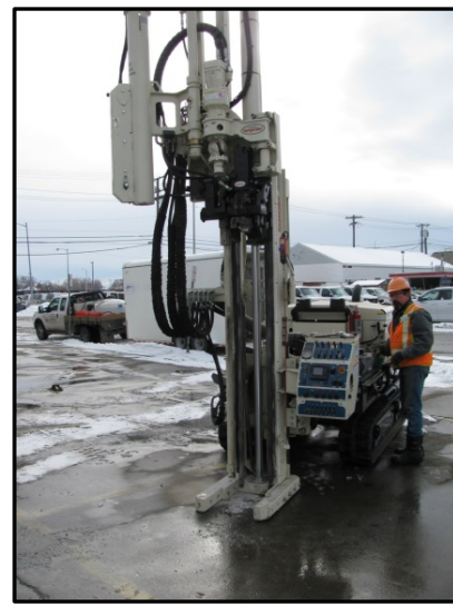
GeoProbe rig installing soil boring at a former service station, Billings (Jan. 2016)