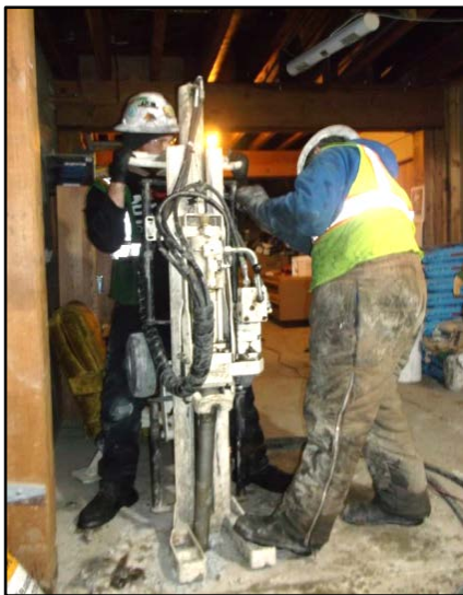
Drilling through basement floor for injection of in-situ treatment chemicals near former dry cleaners, Havre (Feb. 2016)