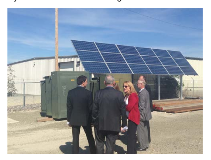
Members of the ETIC visit NorthWestern Energy's Battery Storage Project in Helena during a Sept. 2015 meeting.

Net metering is available on both the NorthWestern Energy (NWE) and the MontanaDakota Utilities (MDU) systems. Montana's rural electric cooperatives also offer net metering. Montana's net metering statutes codified in Title 69, chapter 8, part 6 only apply to NorthWestern Energy. Rural electric cooperatives are explicitly exempt from those