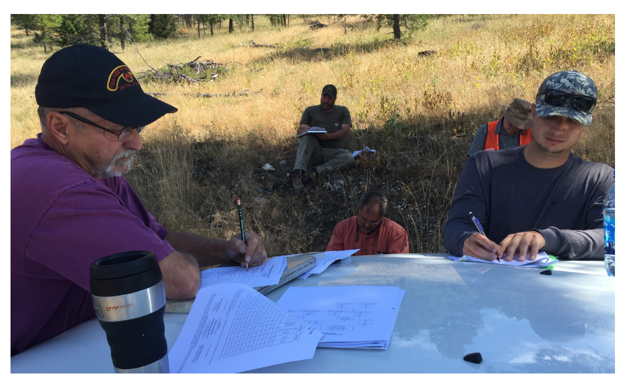
After a couple of hours of inspecting roads and the timber sale site, members of the team gather in the shade to score the project against the best management practices.

The EQC study was a response to legislation about forest practices that shifted away from the reforestation focus of the 1940s. In the 1970s, Oregon, Idaho, California, Nevada, and Wash-